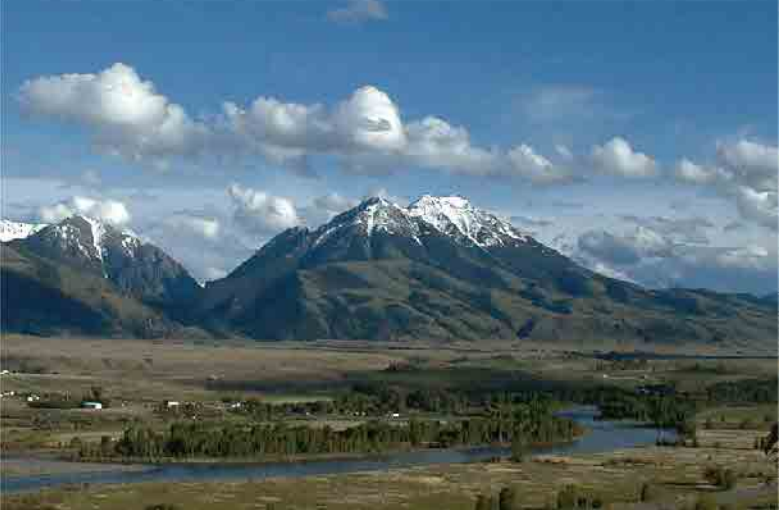
Inside Picture: 18.25" x 9.25" Figure 2